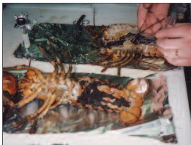
Fish and shellfish are usually steamed prior to sensory testing. Once cooked, these lobsters have been opened, and the digestive gland and white meat are tested for taint by smell and taste.

The taint-free threshold can be defined as the point where a representative number of samples from the polluted area are no more tainted than an equal number of samples from a nearby area or commercial outlet outside the spill zone. This