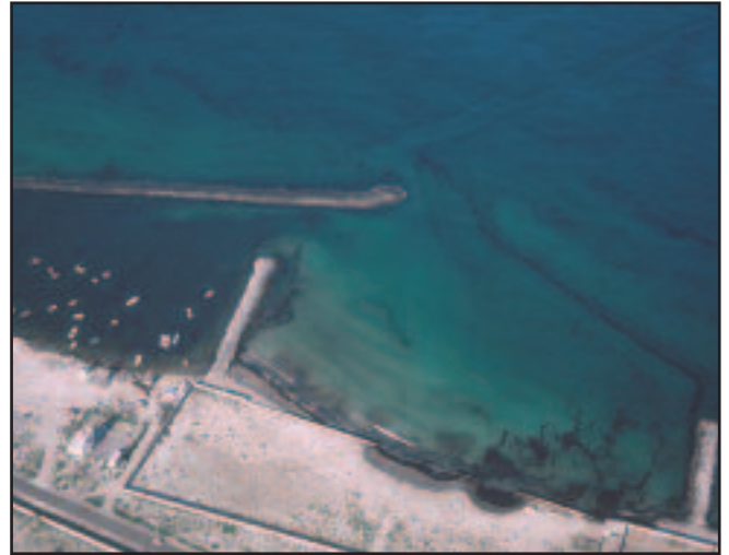
Oil in the vicinity of fishing ports or in fishing grounds can result in interruption of business.

In calm conditions fish farms can sometimes be protected with heavy-duty plastic sheeting wrapped around the perimeter of the cages, thereby preventing floating oil from entering the nets or contaminating the floats. The sheeting should not extend too far below the water surface and should be weighted at the bottom edge to prevent it from riding up as a result of weak currents or light wave action.