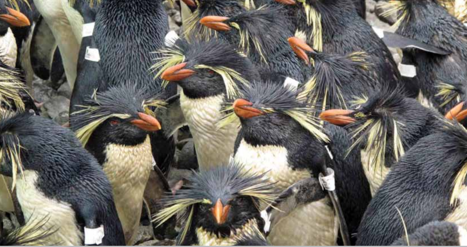
Northern Rockhopper penguins tagged and awaiting release after the OLIVA spill, Tristan da Cunha

THE NEWSLETTER OF THE INTERNATIONAL TANKER OWNERS POLLUTION FEDERATION LIMITED