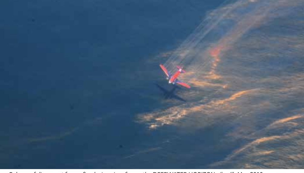
Release of dispersant from a fixed wing aircraft over the DEEPWATER HORIZON oil spill, May 2010

As often occurs after a large oil spill incident, numerous R&D projects have been commissioned by government agencies, industry and other interested parties, the results of which are being monitored by ITOPF. Latterly, ITOPF has been invited to join an Advisory Committee comprised of a consortium of stakeholders in the Gulf region and to act as 'advisers/mentors' to various R&D projects being funded by BP in the aftermath of the DEEPWATER