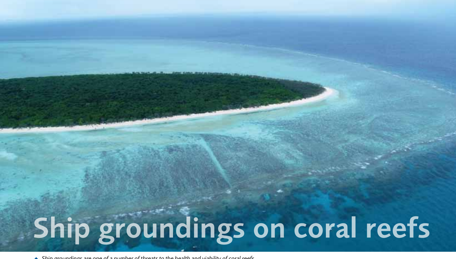
Ship groundings are one of a number of threats to the health and viability of coral reefs

TOPF's technical services are not restricted to the provision of advice on oil and chemical spills. Increasingly our assistance is being sought in relation to damage to coral reefs caused by ship groundings.