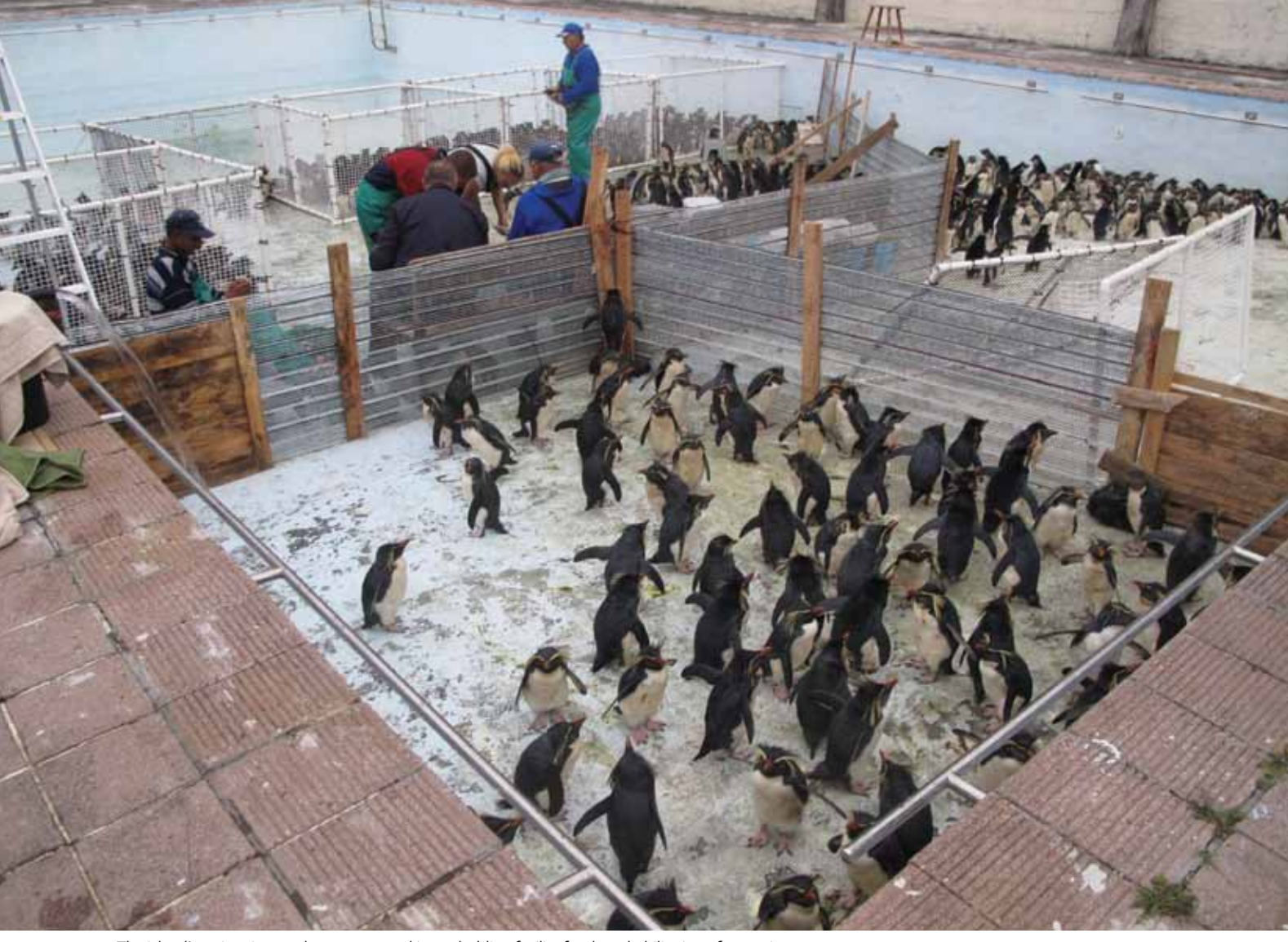
The island's swimming pool was converted into a holding facility for the rehabilitation of penguins

large number of seabirds, including the endangered Northern Rockhopper penguin. Tristan da Cunha also supports a small but profitable lobster fishery, which accounts for more than 70% of the island's income and is managed by the islanders in co-operation with the sole fishery concession holder based in South Africa.