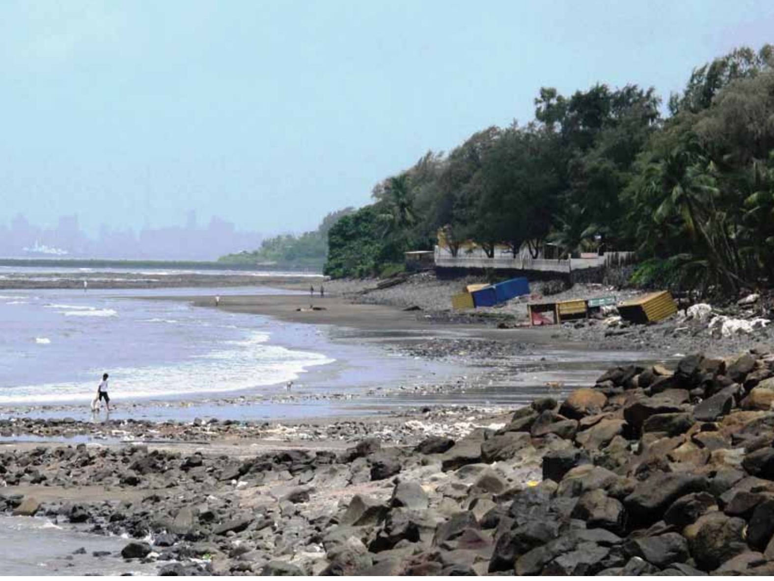
Stranded containers from MSC CHITRA

production of leaflets and notices in various local languages providing information about the dangers of these canisters. Air modelling was also undertaken in order to establish safety zones in the event that a canister was breached. Regular surveys of the shorelines were carried out by the manufacturer of the aluminium phosphide using suitable Personnel Protective Equipment (PPE) in order to remove any suspect canisters and to dispose of them safely. Air monitoring was undertaken at all shoreline sites prior to, and during, clean-up to ensure that they were free of phosphine gas. ITOPF had regular and open communication with the Indian authorities throughout the cleanup and advised them on the strategy for protecting personnel. Clean-up operations were completed five months after the spill. After an extensive salvage operation, which involved the removal of the remaining bunkers and the majority of the containers, the vessel was refloated in March 2011. However, due to the MSC CHITRA's poor physical condition, it was decided that the most suitable option was to scuttle the ship in international waters in April.