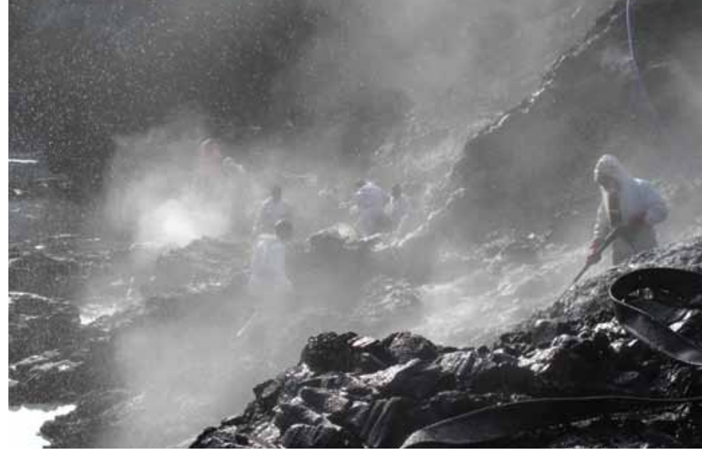
High pressure hot water washing at a sheltered cove on Middle Island, Tristan da Cunha Island Group

hedifficulties of locating and responding to oil spilt in ice-covered waters was highlighted by the grounding of the container ship GODAFOSS. The incident occurred in the Hvaler-Fredrikstad archipelago (Ytre Hvaler National Marine Park) in southern Norway, approximately 10 km from the Swedish border, in February 2011. At least two bunker tanks were breached and current estimates suggest approximately 120 MT of oil (IFO 380) was released into the sea. The vessel was also carrying a number of containerised