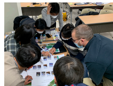
Training with the Korea Coast Guard