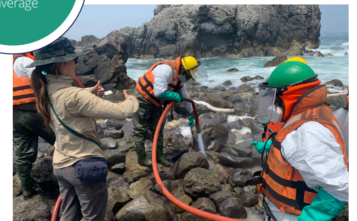
Providing advice on-site in Peru

We attend 15 incidents per year on average